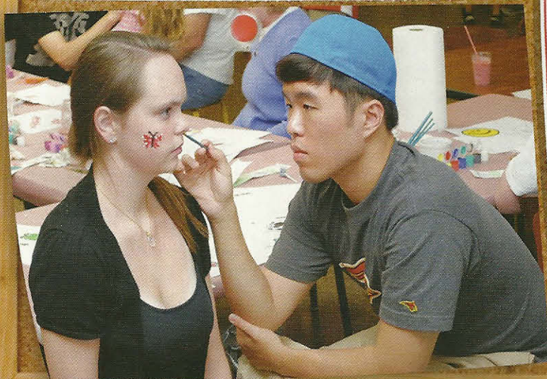
Clockwise from upper left: A post card listed the major activities scheduled for the anniversary year; The Baltimore Catholic Review issued a special edition to mark the anniversary; "Old Hall," the school's location from 1891 to 1960; the family fun fair returned after an absence of several decades.

Calvert Hall College High School Uses Anniversary to Reflect on the Importance of the School and to Create Increased Awareness