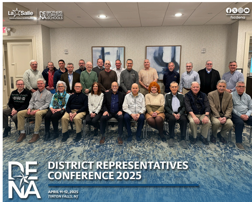
Group photo taken in April 2025

The Conference theme was "How am I Doing" and featured a keynote address