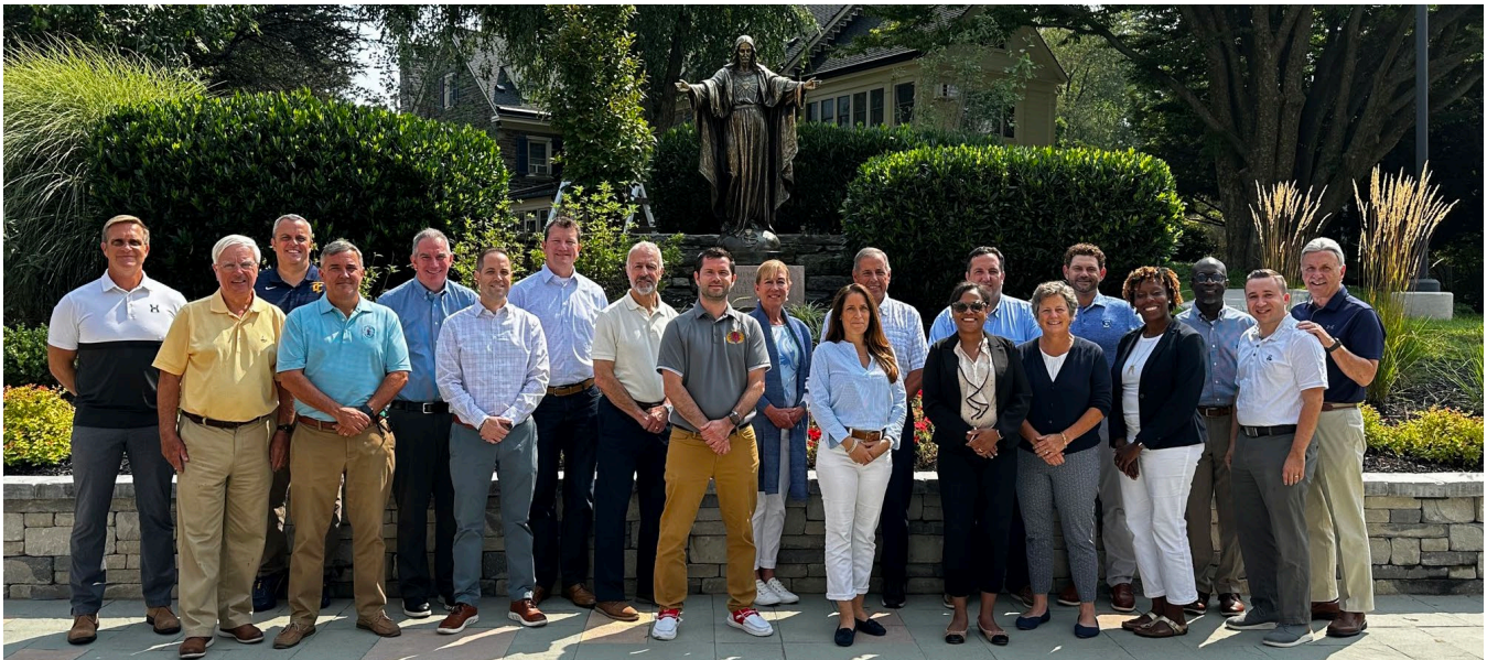
Group photo taken in August 2024

For the first time since Covid, the OMM convened all of the new Lasallian leaders in the District. We have defined new leaders as Board Chairs and Chief Administrators. For this workshop Chief Administrators includes both Presidents and Principals of the secondary schools, Presidents and Principals of the San Miguel Schools, and Executive Directors of the LAYFS ministries.