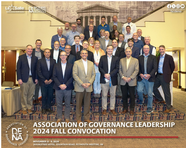
Group photo taken in November 2024

Dates: Friday November 8 – Saturday November 9