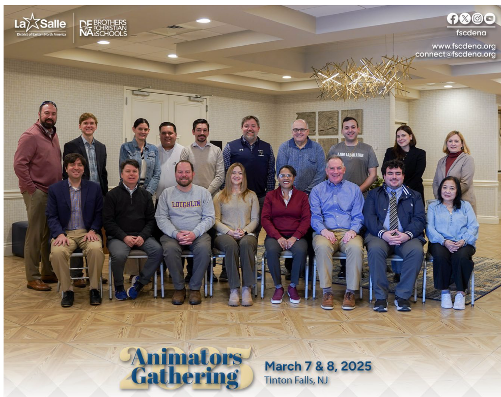
Group photo taken in March 2025