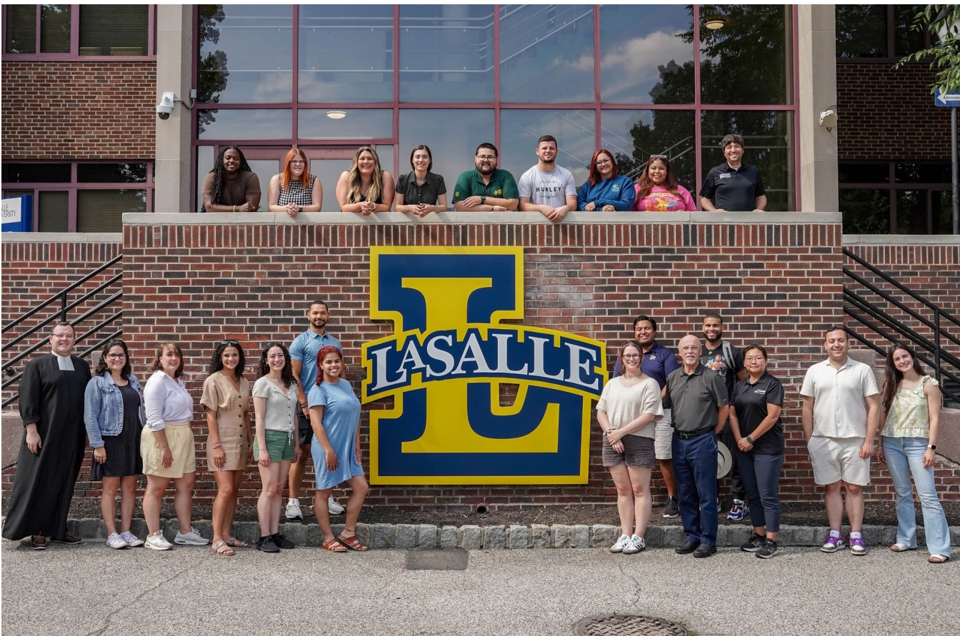
Group photo taken in August 2024

DENA hosted its seventh Young Lasallian Professionals conference at La Salle University (Philadelphia) in July, 2024. For most of the 16 participants, VEGA offered an initial formation opportunity and a glimpse into the vast geographic and ministerial swath of DENA and the wider Lasallian world. The District Young Lasallian Council curated sessions around topics that would be most beneficial in developing these young faculty and staff members, including a culture of vocation, the Founding Story, faith and Lasallian spirituality, Catholic social teaching and social justice, Springtide research into Gen Z students and teachers, and self-care. In addition, the VEGA attendees had opportunities for an afternoon of community service, two liturgies, daily morning and evening prayer, and frequent community building. Small group sessions complemented the presentations, allowing for both processing the content and discerning how to imbue the material into their daily routines.