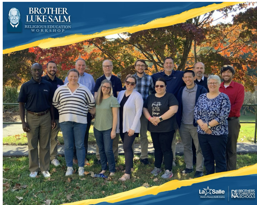
Group photo taken in October 2024

The Luke Salm Workshop aims to create a dynamic space to share challenges and insights, to promote professional and spiritual development, and advance the Lasallian vision and hopes for evangelization and religious education in our times. The 46th General Chapter of the Brothers of the Christian Schools (2022) calls us to “renew our zeal for catechesis and evangelization.” It states further: