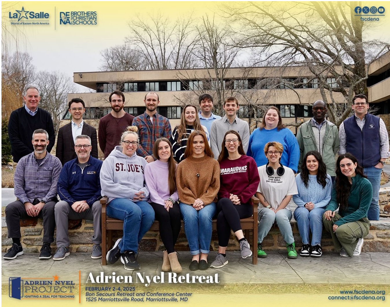
Group photo taken in February 2025